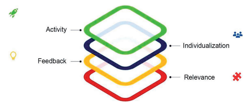
Figure 2. FAIR Principles for assessment as learning (AaL)

As far as adopting modern medical education methods and techniques to a specific disci-