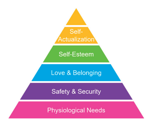
Figure 3. Maslow's hierarchy of needs