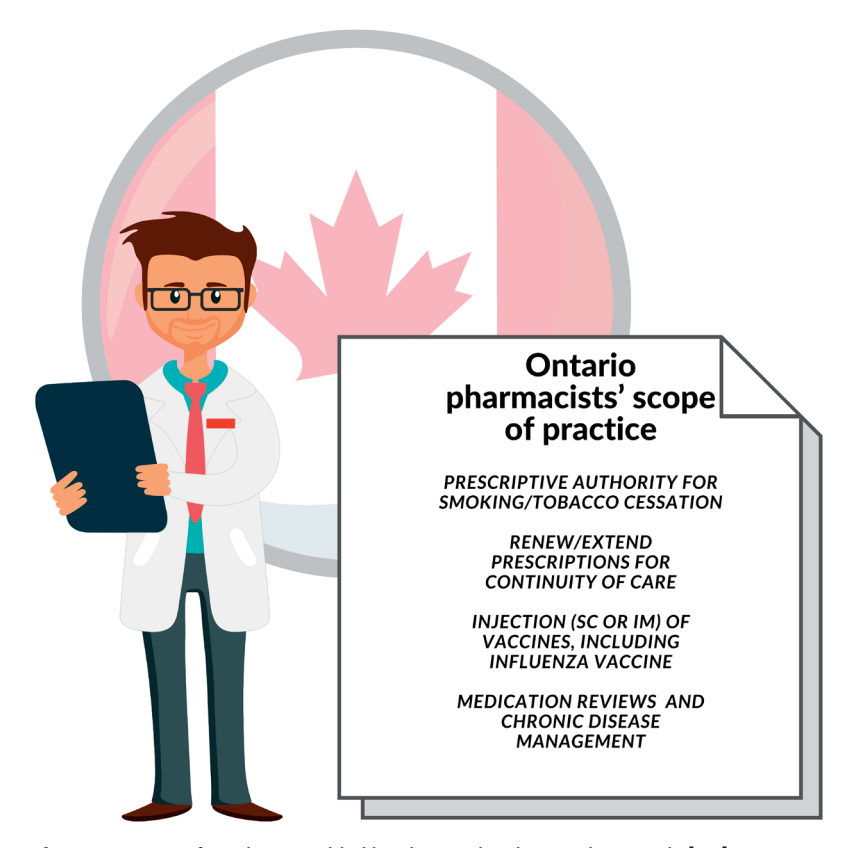
Figure 1. Types of services provided by pharmacists in Ontario, Canada [4,5]